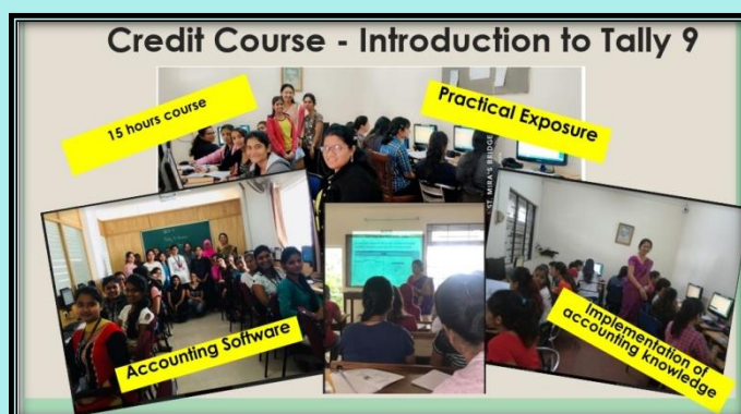
Introduction to Tally 9