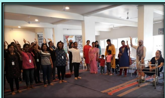
Certificate course in Disability