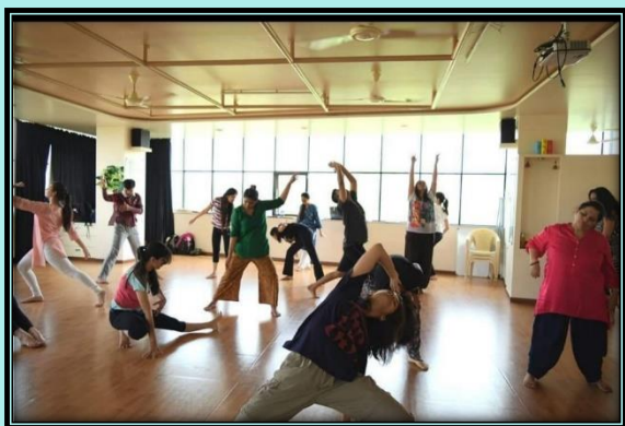
Dance Movement Therapy in action