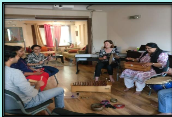
Clinical Music Therapy in action