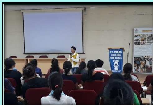
Certificate course in Disability