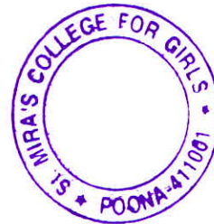
Principal Incharge St. Mira's College for Girls, Pune.