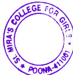
Principal Incharge St. Mira's College for Girls, Pune.