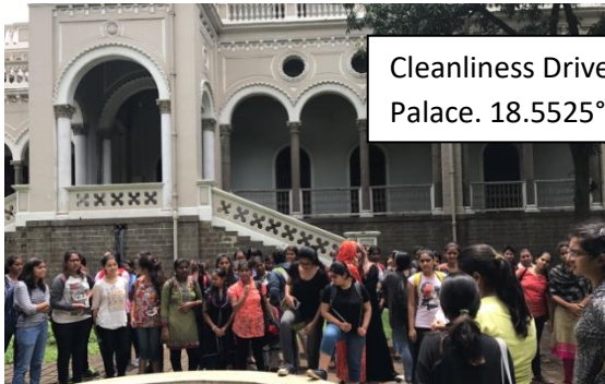
Cleanliness Drive at Aga Khan Palace. 18.5525° N, 73.9015° E