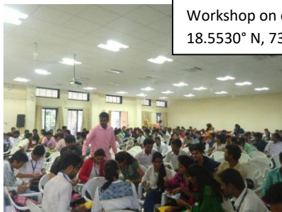
Workshop on e-waste- SPPU Campus 18.5530° N, 73.8265° E