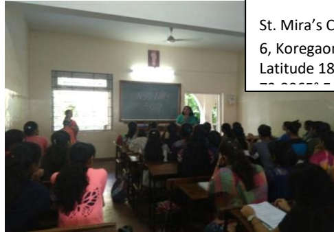
Discussion with the Students St. Mira's College for Girls 6, Koregaon Road, Pune - 411001 Latitude 18.5349° N, Longitude 73.8865° E