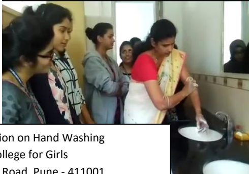
Demonstration on Hand Washing St. Mira's College for Girls 6, Koregaon Road, Pune - 411001 Latitude 18.5349° N, Longitude 73.8865° E