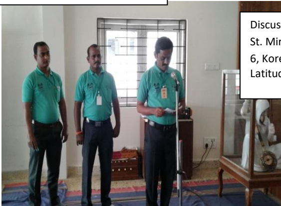
Discussion about Use of Sanitizers St. Mira's College for Girls 6, Koregaon Road, Pune - 411001 Latitude 18.5349° N, Longitude 73.8865° E