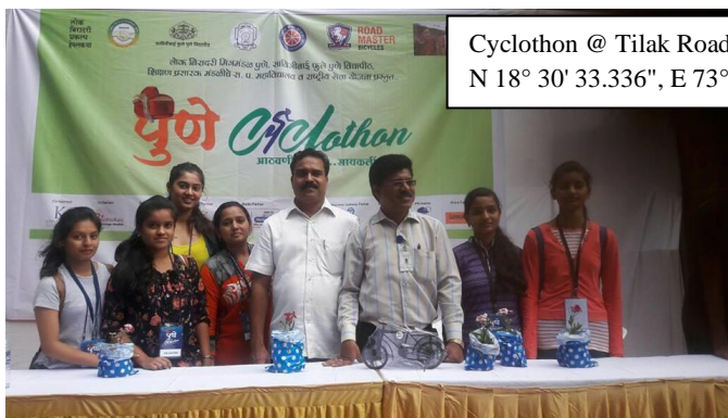
Cyclothon @ Tilak Road N 18° 30' 33.336", E 73° 50' 52.548"