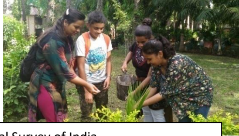
Botanical Survey of India. 6, Koregaon Road, Pune - 411001 Latitude 18.5349° N, Longitude 73.8865° E