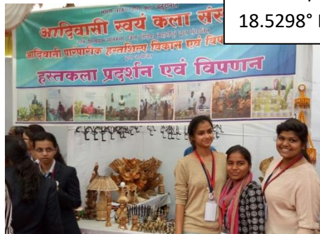
Tribal Research & Training Institute/Coordinates 18.5298° N, 73.8859° E