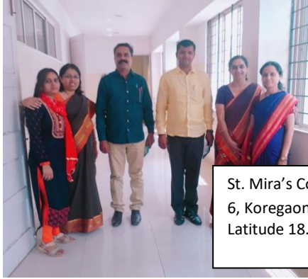
St. Mira's College for Girls 6, Koregaon Road, Pune - 411001 Latitude 18.5349° N, Longitude 73.8865° E