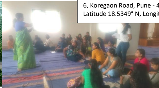
St. Mira's College for Girls 6, Koregaon Road, Pune - 411001 Latitude 18.5349° N, Longitude 73.8865° E