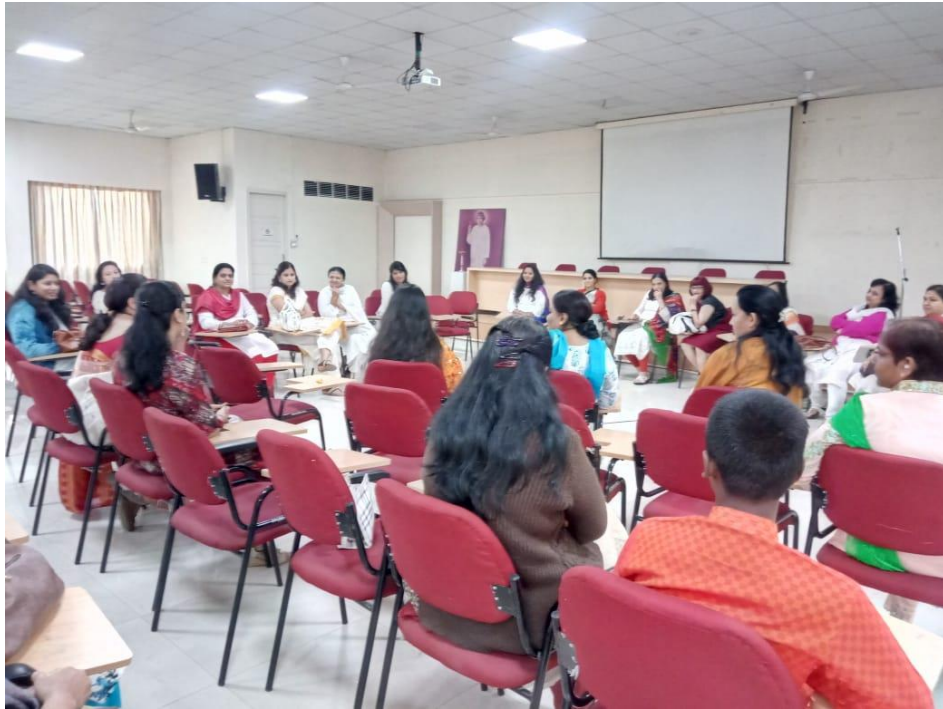
The Proceedings and the Resolution of the Alumni Association