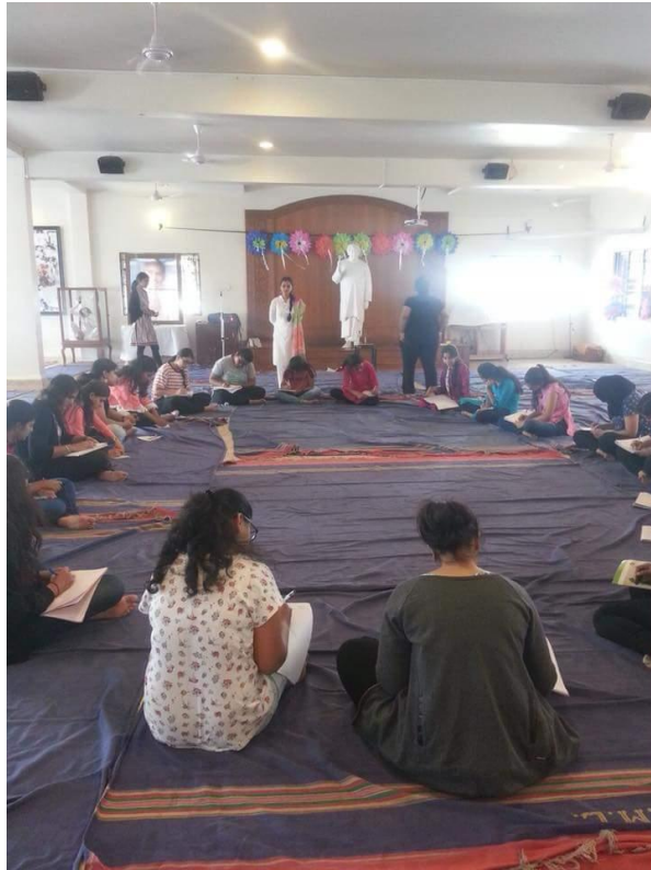
Stress Management Workshop for BBA students_2018-19