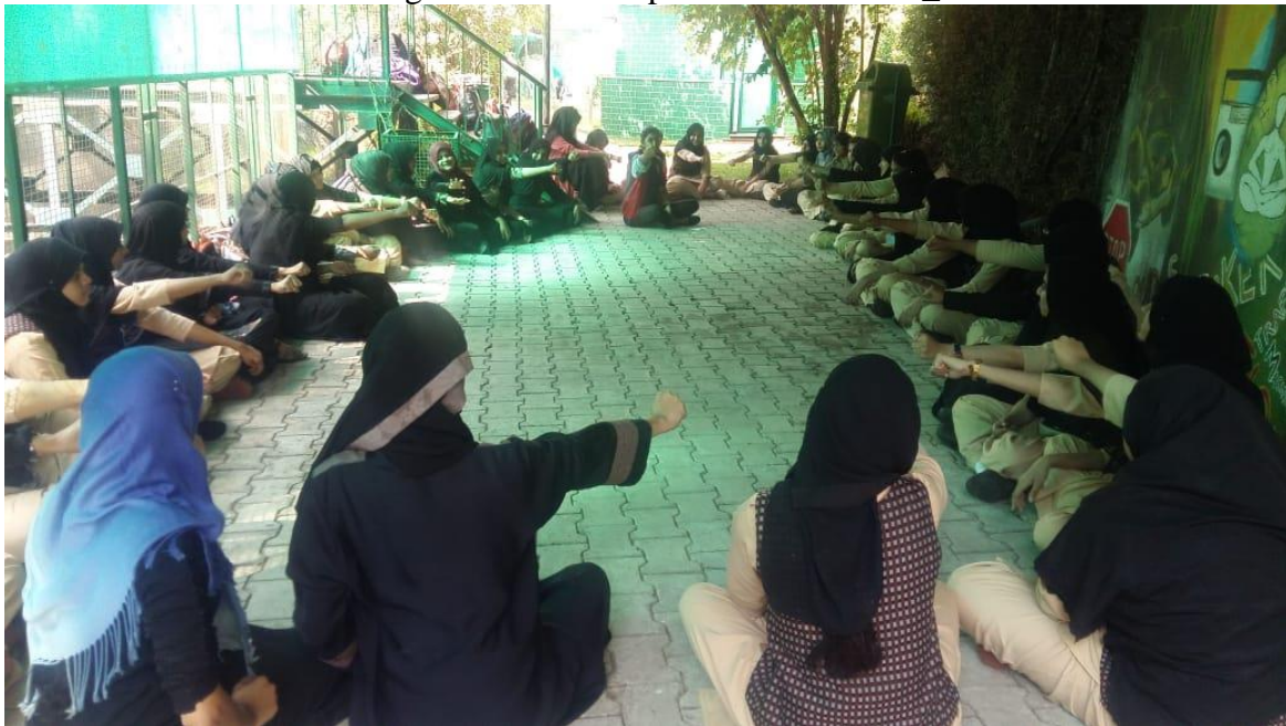
Peer Stress Management Session_Aeda Inamdar College_2018-19