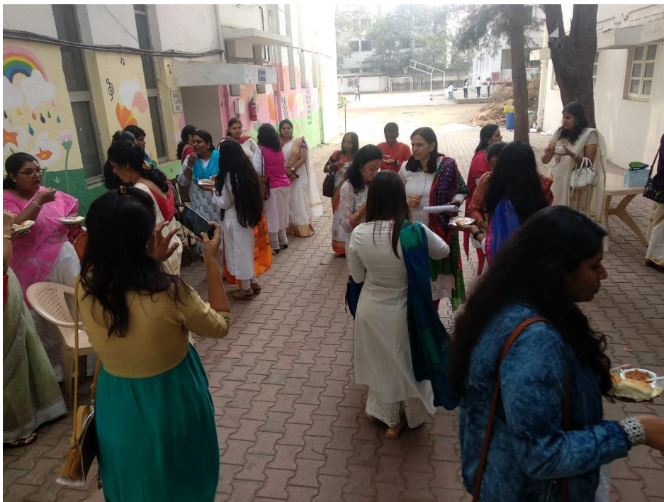
St. Mira's College Alumni Association enjoying the Refreshment