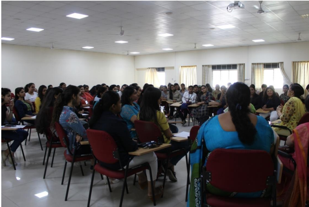
Principal's Address to the Alumni