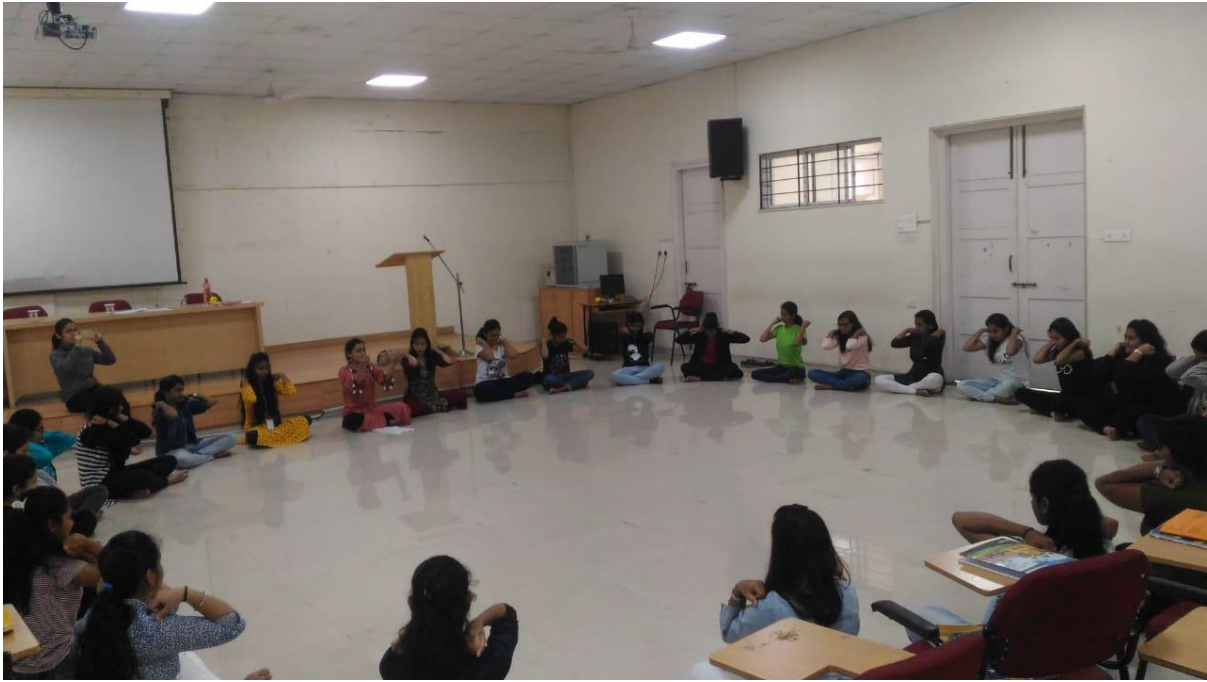
Stress Management Workshop for BBA students_2019-20