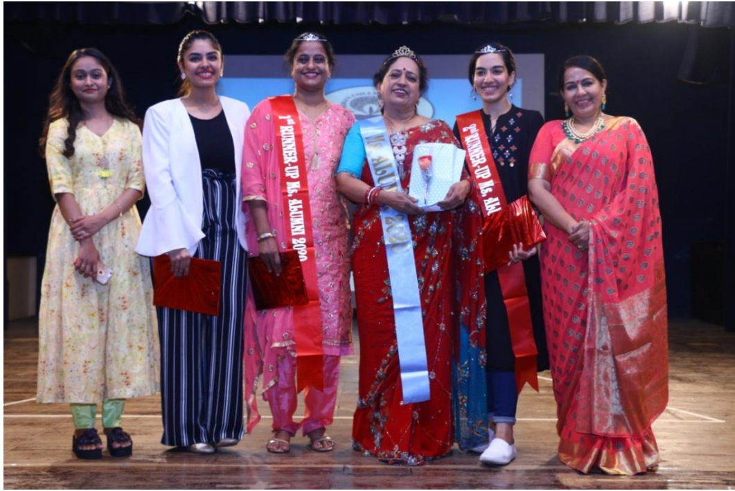
The winners of Ms Alumni Contest with the Judges