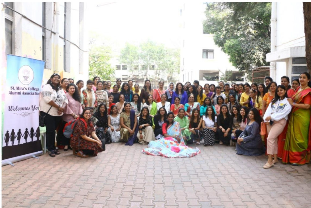
The Proud Miraites