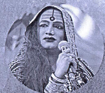
Laxmi Narayan Tripathi