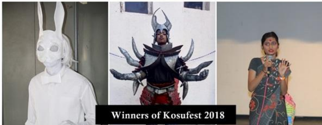
Winners of Kosufest 2018