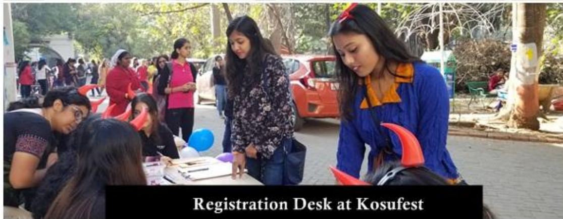
Registration Desk at Kosufest