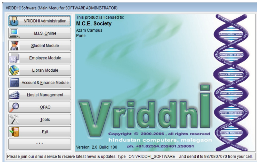
Gateway Screen for “Vriddhi-Classic ERP” software