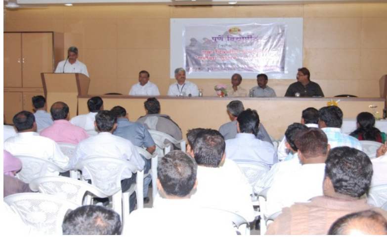
Vridddhi ERP software training workshop sponsored by university of Pune