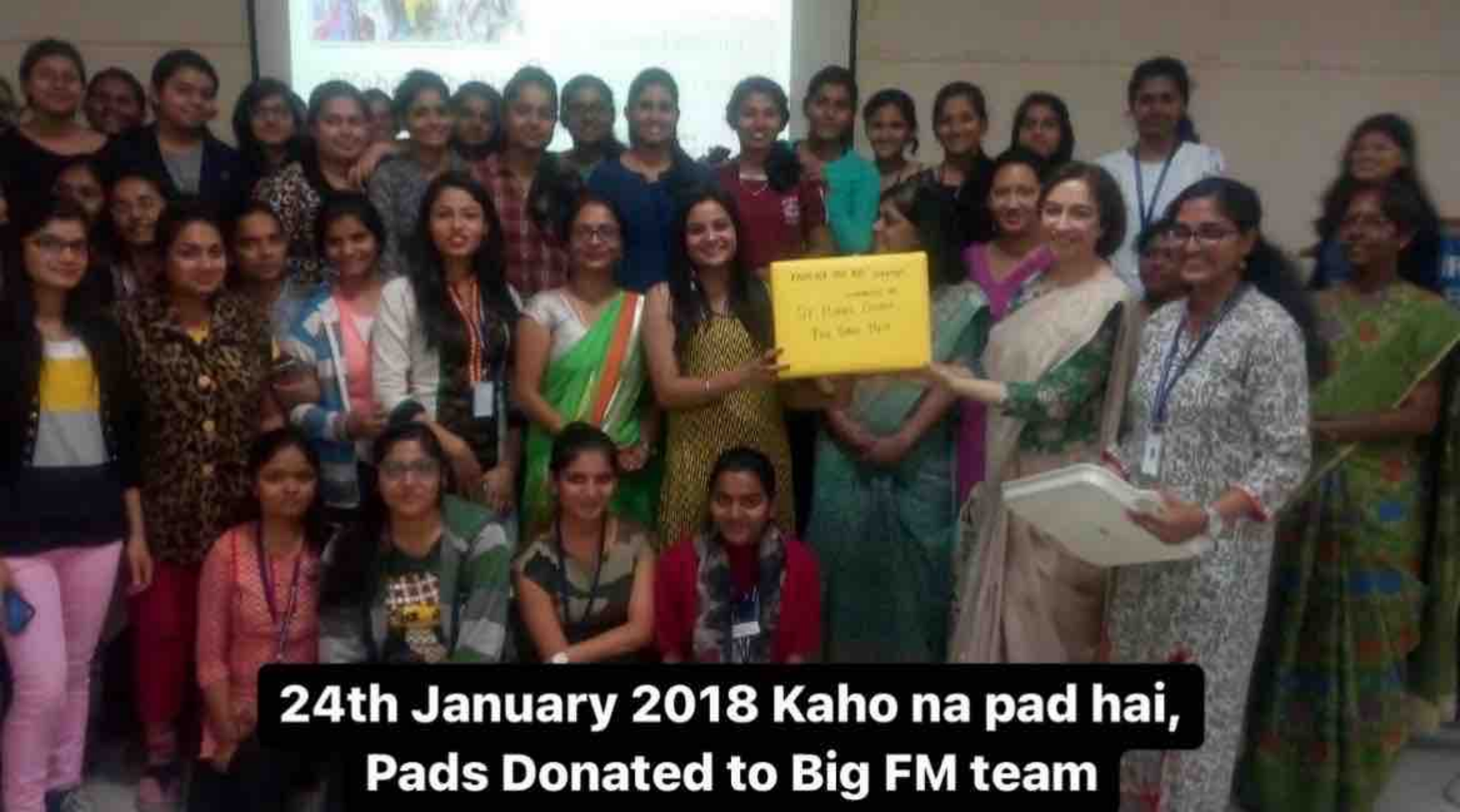
24th January 2018 Kaho na pad hai, Pads Donated to Big FM team