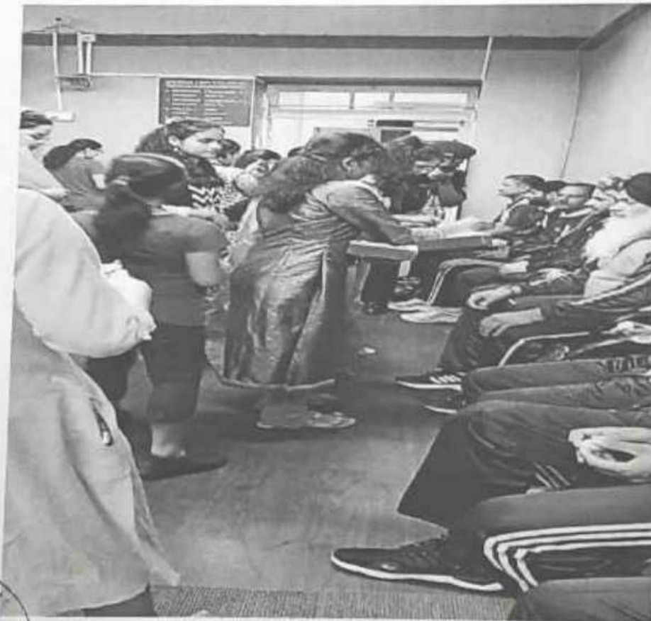
PIC 5: ALC Visit 2019-20