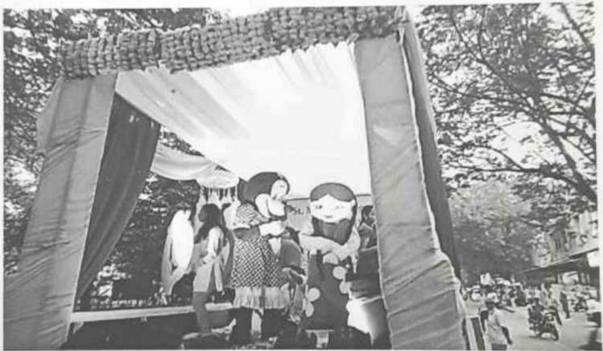
PIC 2: Rath Yatra: 2018-19