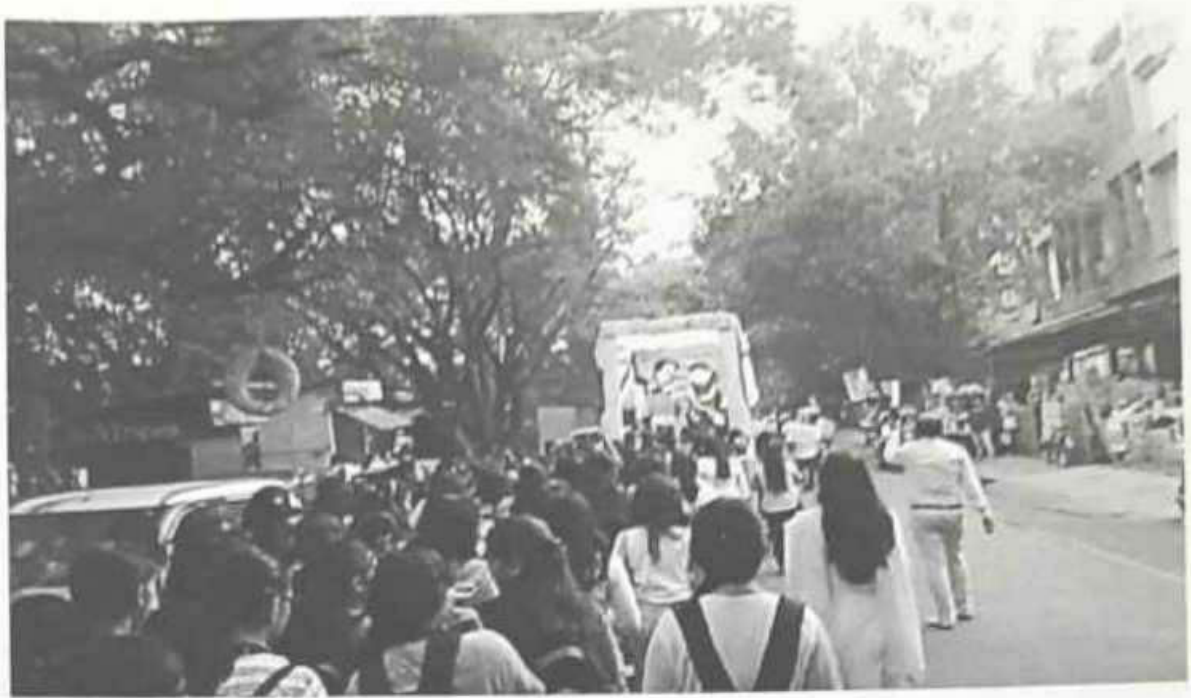
PIC 1: Rath Yatra: 2017-18

Autonomous (Affiliated to SavitribaiPhule Pune University)