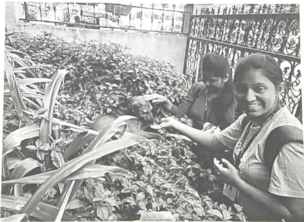
PIC 2: Animal Rescue 2018-19