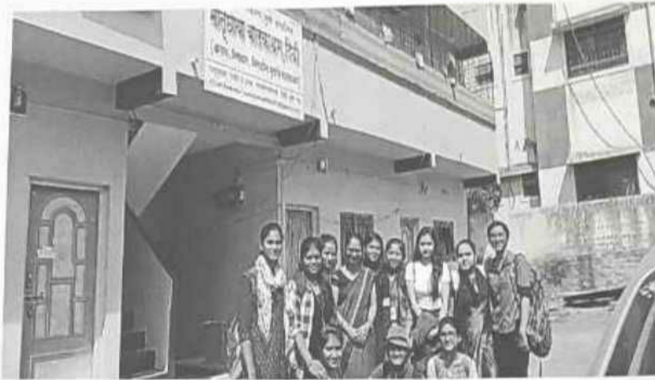
PIC 4: MatruchyaBalashram 2019-20

Autonomous (Affiliated to SavitribaiPhule Pune University)