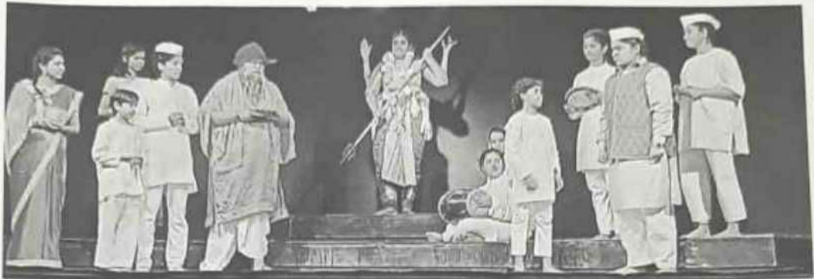
PIC 1: DADALEELA