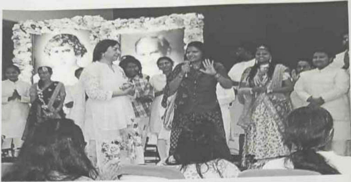
PIC 3: DADALEELA

Autonomous (Affiliated to SavitribaiPhule Pune University)