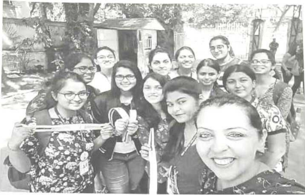
PIC 1: Animal Rescue 2018-19

Autonomous (Affiliated to SavitribaiPhule Pune University)