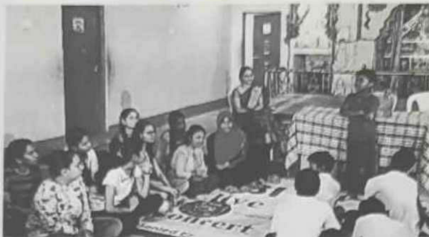
PIC 6: Social Service: Mauli Krupa 2017-18

Autonomous (Affiliated to SavitribaiPhule Pune University)