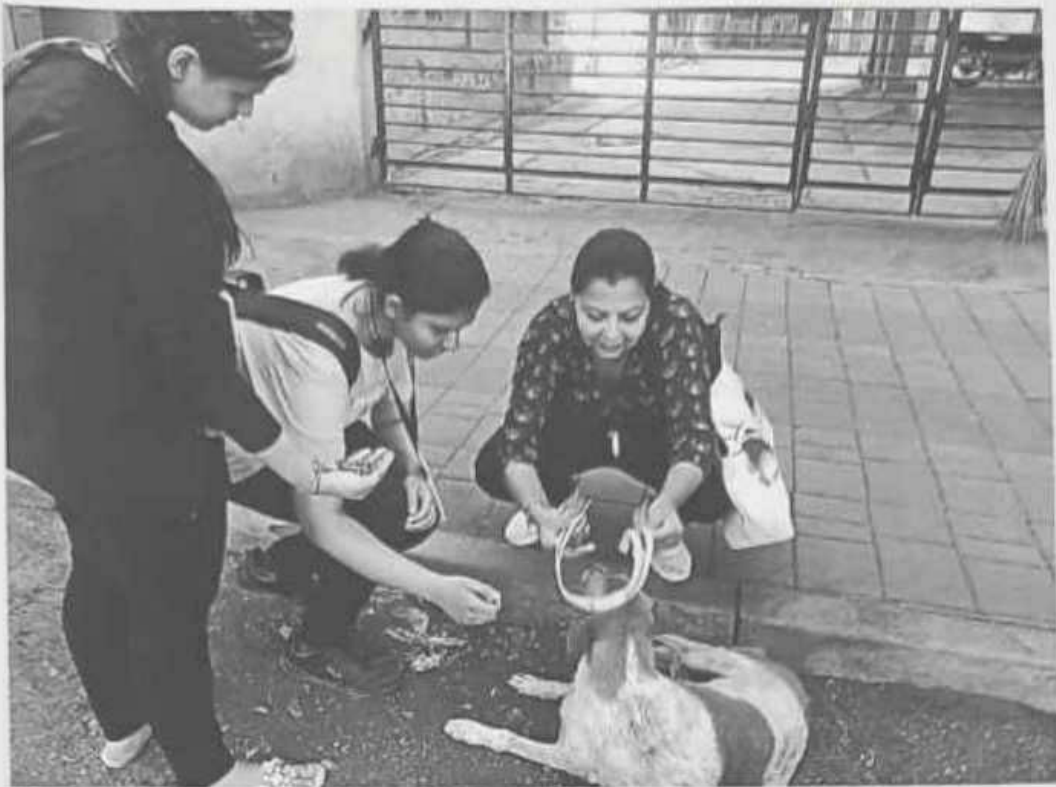
PIC 3: Animal Rescue 2018-19

Autonomous (Affiliated to SavitribaiPhule Pune University)