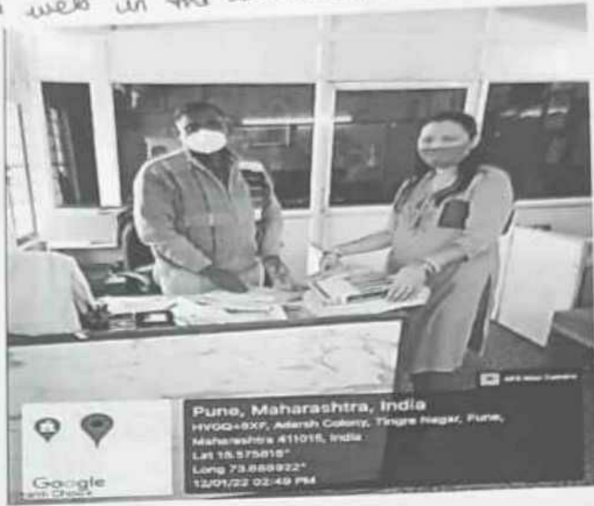
PIC 1: Event: Social Service of TYBCom 'A' Date: 12 th Jan 2022