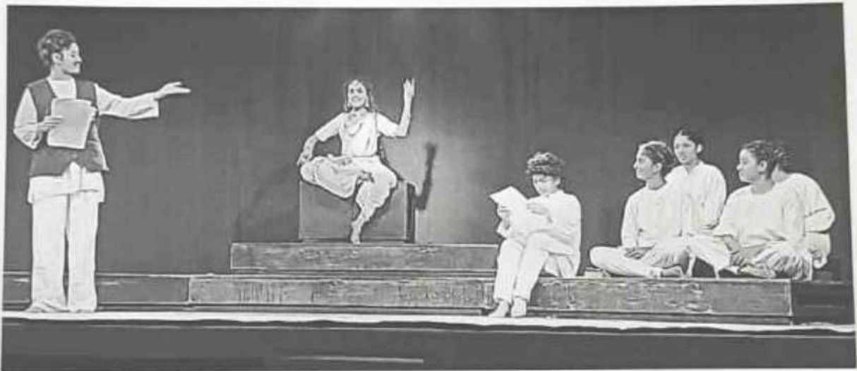
PIC 2: DADALEELA