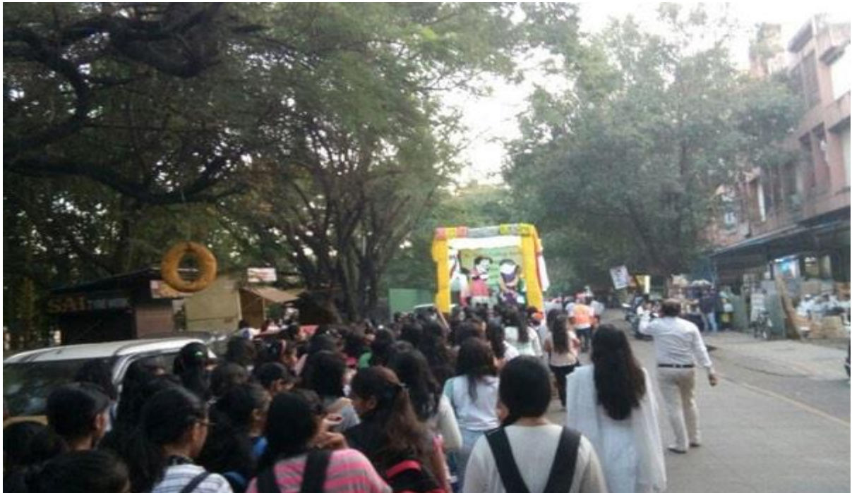
Photo7 : Rath Yatra: 2017-18